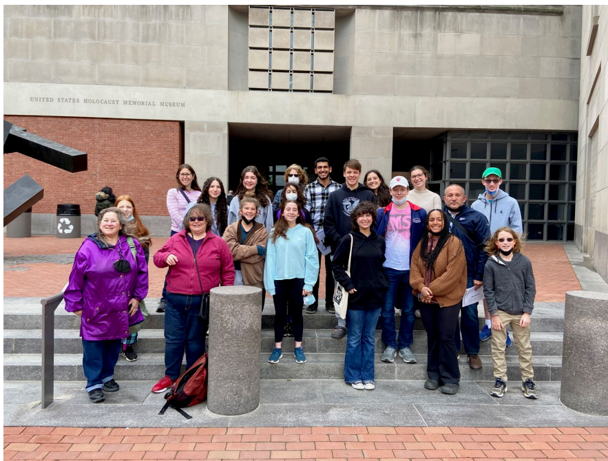
Kitah Na'ahroot Trip to the Holocaust Museum on 5/8