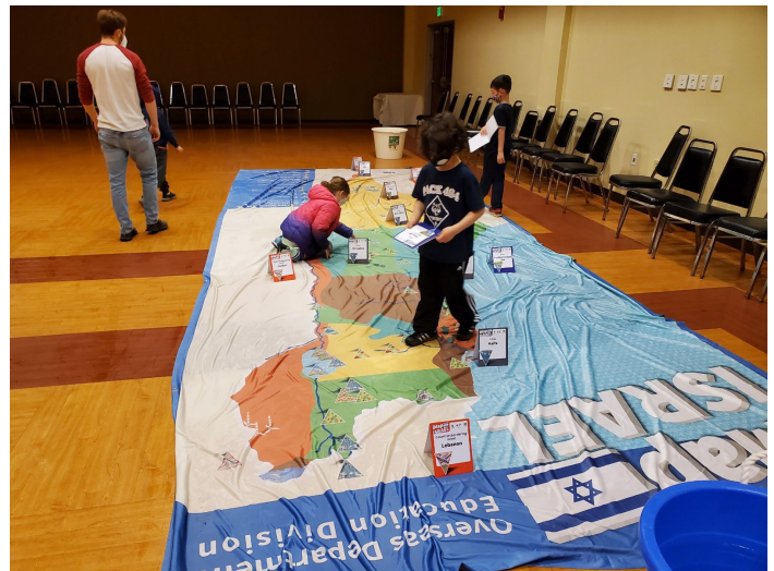
5/8 Map of Israel Activities for Yom Ha'atzmaut/Israel Independence Day