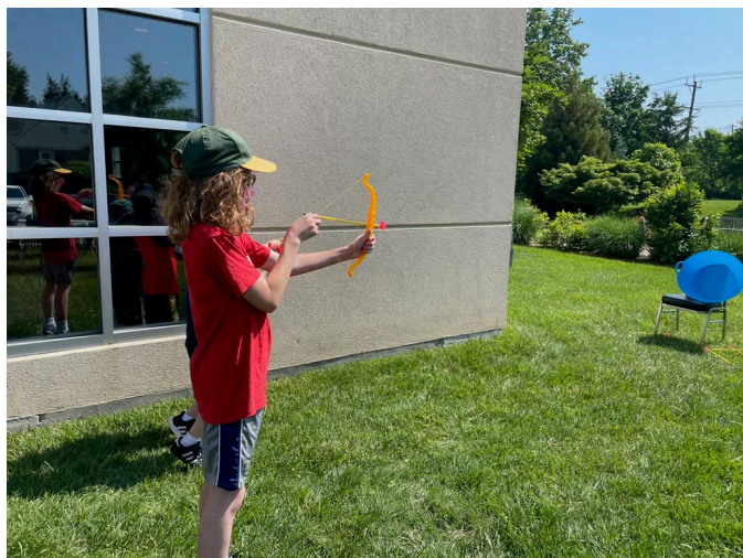
Bow & Arrow Target Shooting