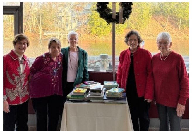
Solos collected some wonderful books for needy Westport children at its holiday party in December.

Solos will be going to Zucca Gastrobar , 30 Charles Street, Westport for lunch at 12:00 noon on Wednesday, January 22. We will be able to order off the menu and have separate checks. For reservations, contact Terry Queirolo at tmq44@icloud.com or 858-1470 by Saturday, January 18.