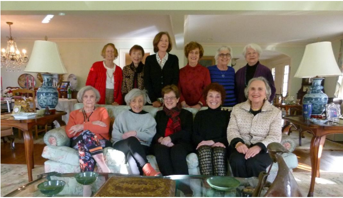
Book Group 2's Holiday Luncheon