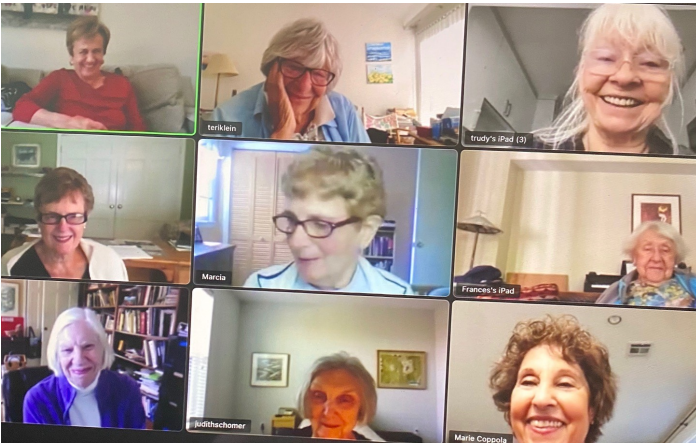
Book Group 3's October meeting on Zoom.