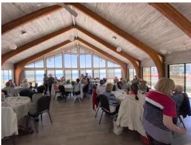
The 2022 Spring Picnic & Annual Meeting was held on May 23 – a beautiful spring day – at the lovely Jackie Durrell Pavilion at Penfield Beach in Fairfield.