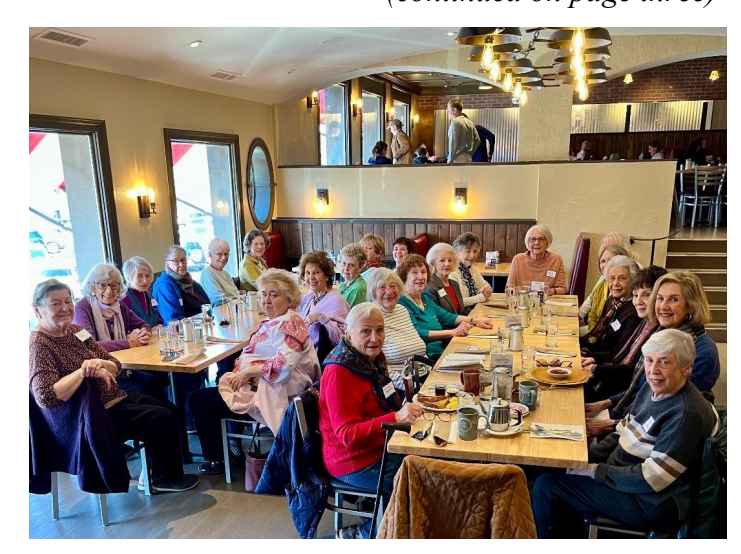
Twenty-three Solos members enjoyed a great luncheon at the Original Pancake House, a new restaurant in downtown Westport, on March 22.