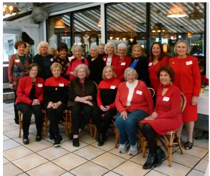
Solos members enjoyed a delicious Holiday Luncheon at Rive Bistro on December 11.