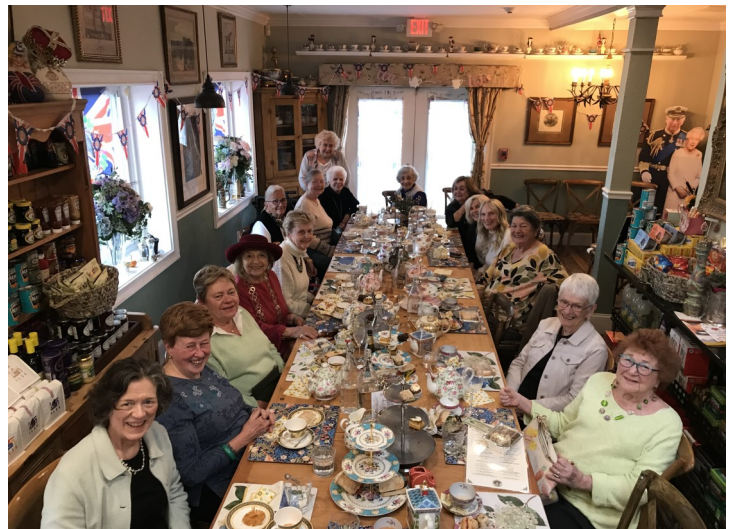
Solos members enjoyed a lovely Afternoon Tea at Gruel Britannia on October 25.