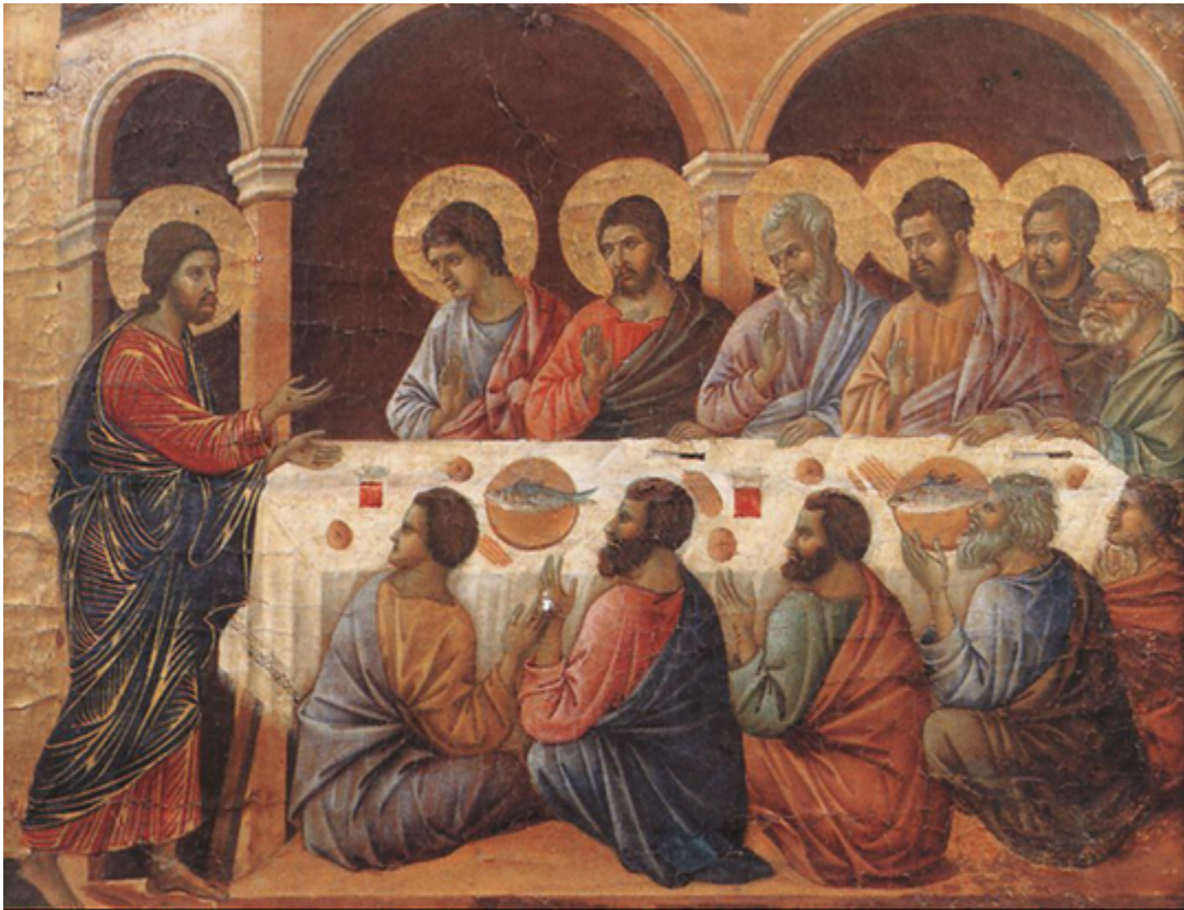
Jesus' appearance while the apostles are at a table, artist Duccio di Buoninsegna circa 1308

The Episcopal Church of the Annunciation 1673 Jamerson Road Marietta, GA 30066 www.ecamarietta.org