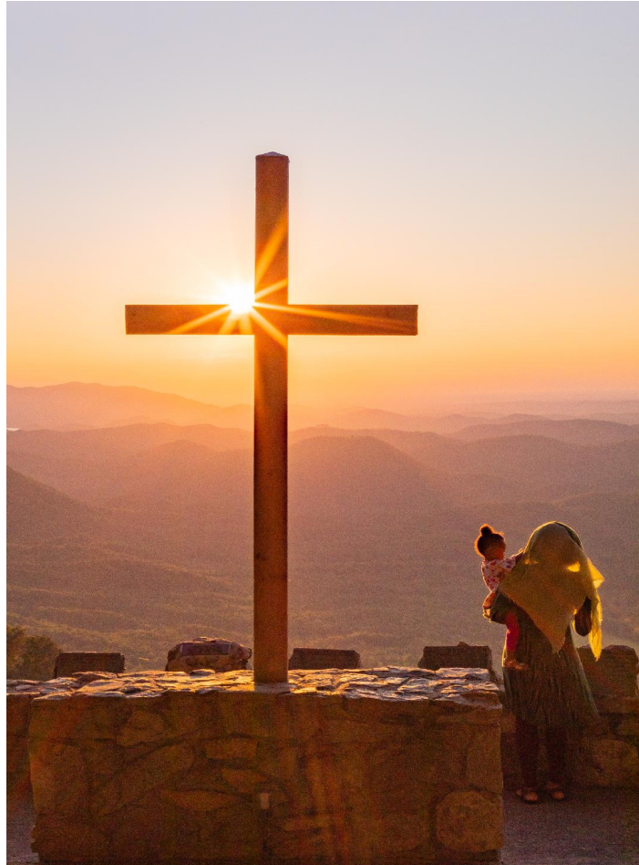
Greenville YMCA Chapel in the hills of the northwest corner of South Carolina