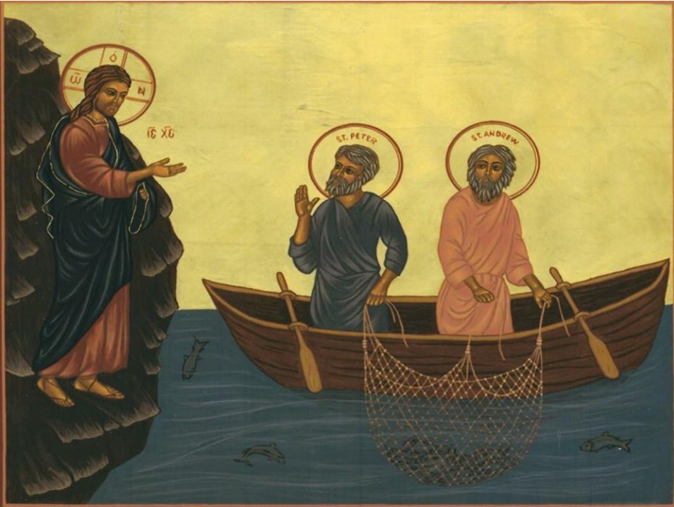
Fishers of Men, Orthodox Icon

The Episcopal Church of the Annunciation 1673 Jamerson Road Marietta, GA 30066 www.ecamarietta.org