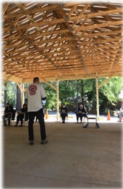
Men's Fishing Trip on October 3 rd .

The year 2021 continued to be an interesting year for worship given the ongoing pandemic, but ECA has been able to consistently gather in person for worship in a safe manner. Some highlights of worship at ECA in 2021: