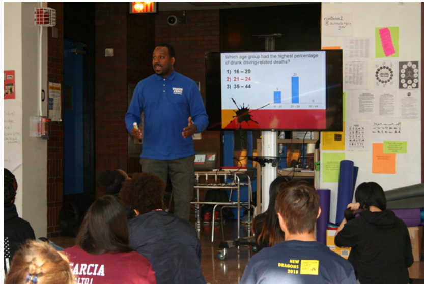
PHYSICAL EDUCATION CLASS