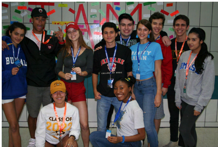
SENIORS: VISION ZERO PARTNERS