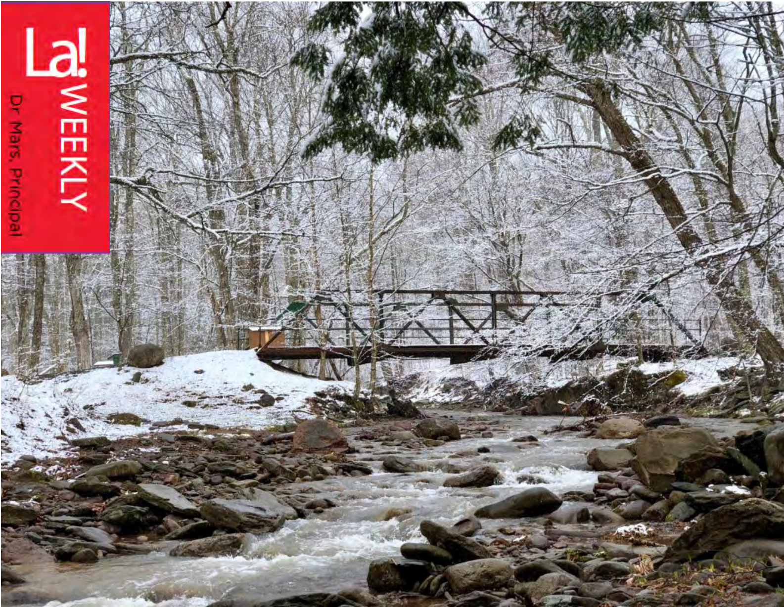
Frost Valley Trip on 4.30.18