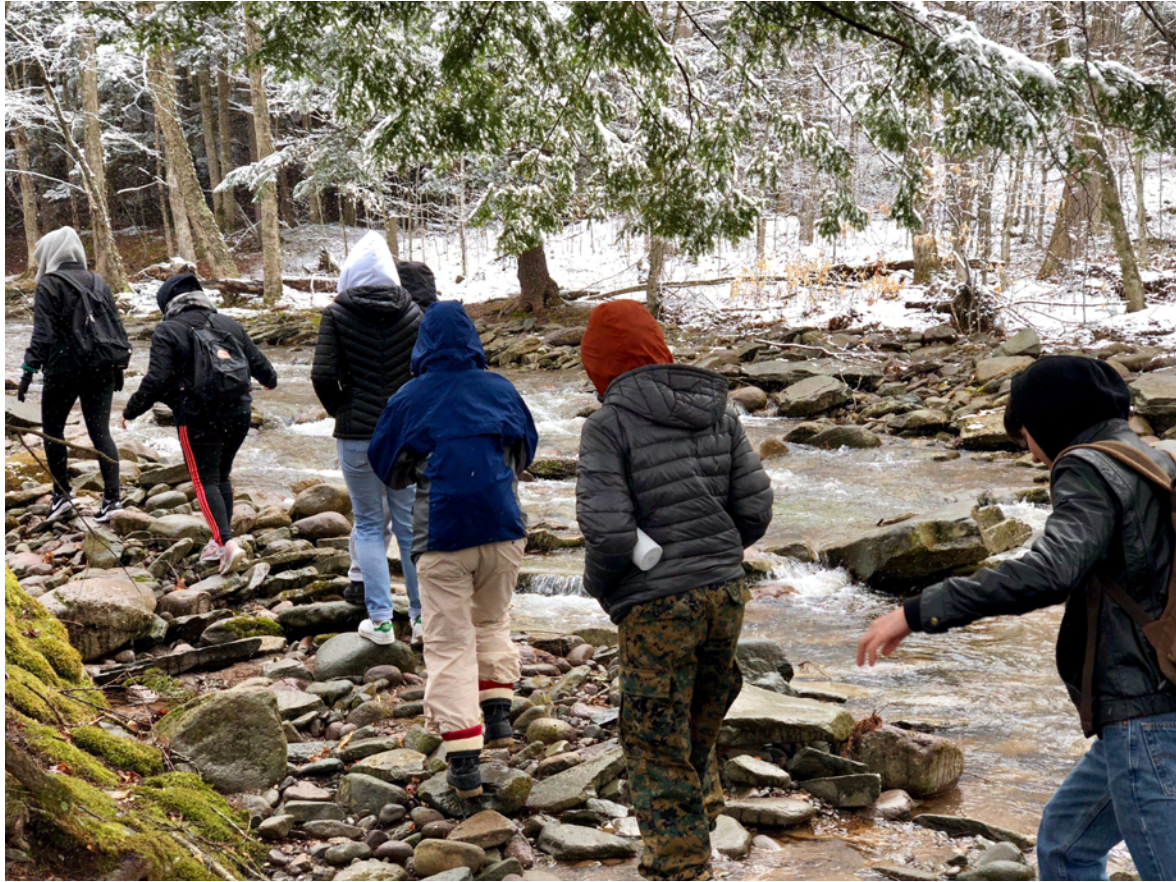
FROST VALLEY TRIP: SCIENCE IS POWERFUL