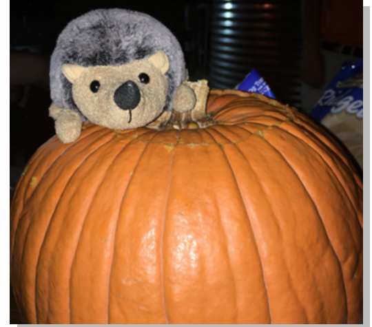
Here is Phil carving a pumpkin to celebrate Halloween!