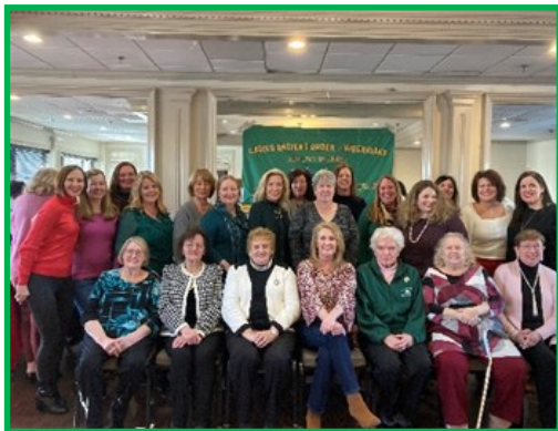
Members of Division 19 at their Annual St. Brigid's Mass & Luncheon