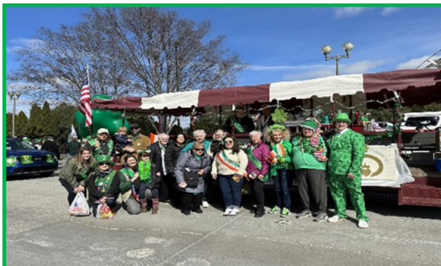
Attendees of the St. Patrick's Day in front of the float

On St Patrick's Day the Division attended mass at Mother of God Church in Covington, KY held in honor of the living and deceased members of the LAOH. Following mass a luncheon was held at Greyhound Tavern in Fort Mitchell, KY