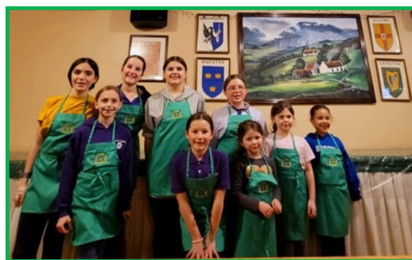
The Albany LAOH Juniors hosted a pasta dinner on January 27 to benefit the Capital Region Food Bank. They raised a whopping $900 which they delivered personally and then pitched in to lend a hand at the food bank. Well done girls!