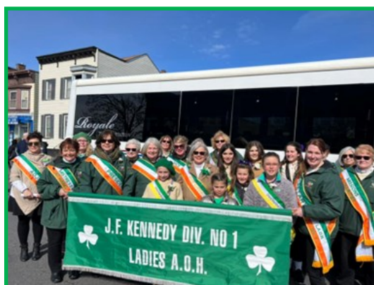
March 11 th , 2023 – LAOH Albany Division 1 members at the Albany St. Patrick's Day Parade