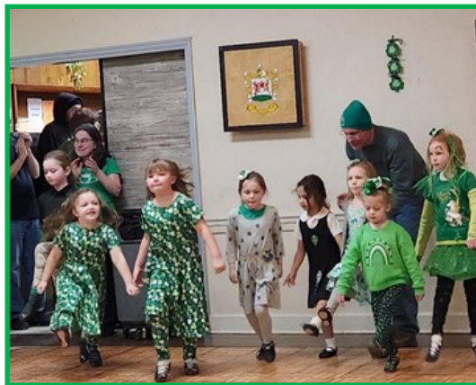
Accomplished dancers in the top photo and the wee ones on the bottom, entertained the crowds at the Steven Walsh Hall both on Parade day and St. Patrick's Day