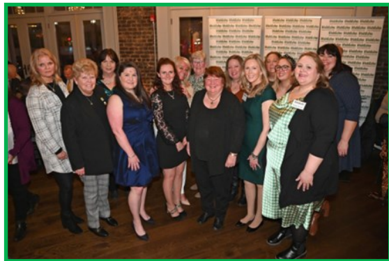
The LAOH turned out to support our members.