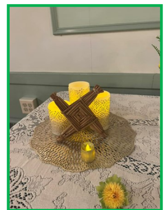
Beautifully arranged table settings were laid out in honor of our Irish Patron Saint Brigid