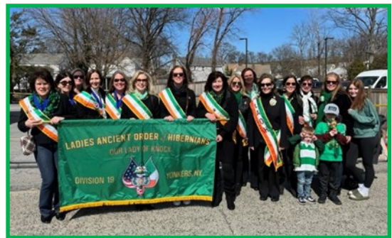
Members of Division 19 in Yonkers St. Patrick's Day parade on 3/18/2023