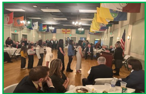
Swearing in of Albany LAOH Junior Division