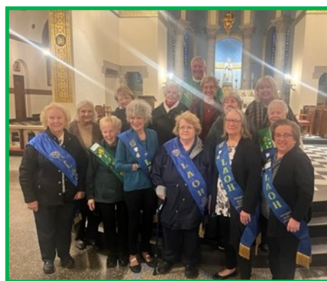
The AOH LAOH State Memorial Mass was held at St. Mary's of Redford Church on Saturday, November 4 th . Members of both the LAOH and AOH held a candlelight procession into the church in memory of those members who passed away this past year.