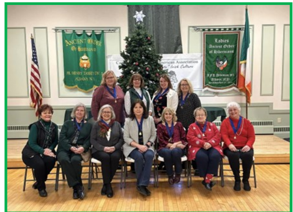
Albany LAOH Board Members

On December 13, the Division collected money for the Columban Sisters at our annual Christmas Party. It was a wonderful evening filled with joy and merriment as we shared a meal and celebrated our sisterhood.