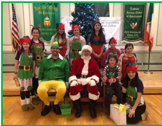
Albany Junior LAOH Members with Santa and his Elf

On December 10 the Albany Junior LAOH Division assisted in hosting a Children’s Christmas Party for all of the Albany AOH and LAOH families. The kids had a wonderful day and the Juniors kept everyone busy with crafts and activities. They even helped Santa and his Elf hand out gifts.