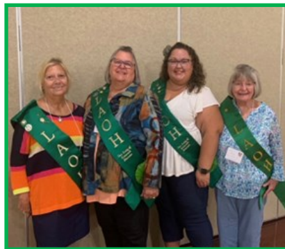
Members from Our Lady of Limerick Division from Genesee County, MI