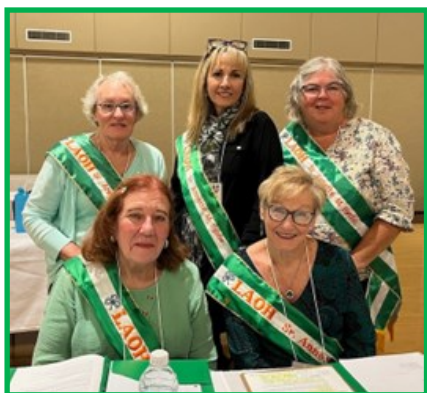
Members of the Sr. Annette M. Byrne Division from Grand Rapids, MI