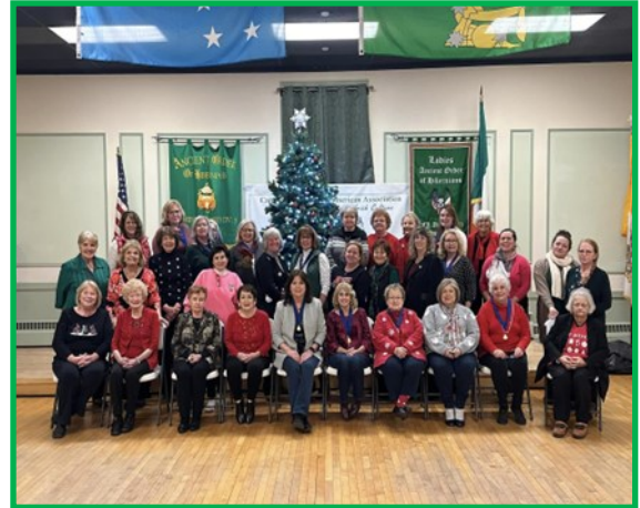
Albany LAOH Membership at our December 2023 Division Meeting

On December 10 the Albany Junior LAOH Division assisted in hosting a Children’s Christmas Party for all of the Albany AOH and LAOH families. The kids had a wonderful day and the Juniors kept everyone busy with crafts and activities. They even helped Santa and his Elf hand out gifts.