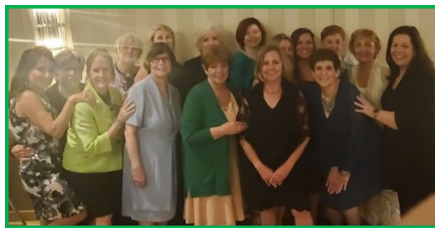
JFK Div 3 at the Emerald Ball

During May we hold our annual baby shower for the Nurses for Newborns. This year we went to their facility and toured, after which we made a $200 donation.