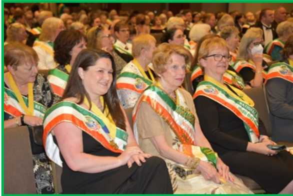
Installation mass and banquet