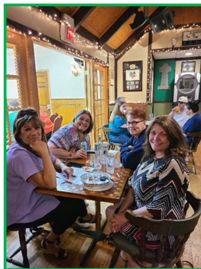
Enjoying the game and the company