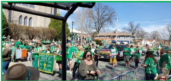
JFK in parade from the Grand Marshal's viewing stand.

During May we hold our annual baby shower for the Nurses for Newborns. This year we went to their facility and toured, after which we made a $200 donation.