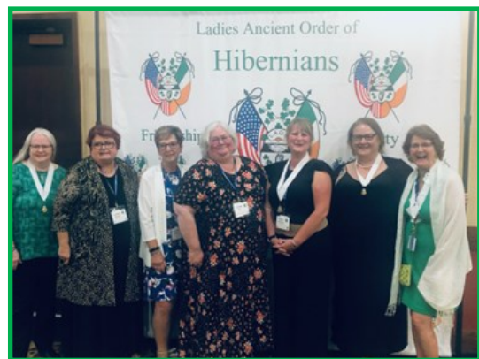
Newly Elected Ohio State Board Officers/Appointees

Ohio LAOH held their convention and Installation of Officers June 24, 2023.