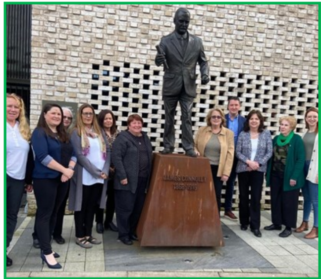
LAOH members outside the James Connolly Centre with John Finucane MP

Along with Relatives for Justice we launched the Trasna na dTonnta ("Across the Waves") Women's Reflections on the Good Friday Agreement publication which included written submissions from women on both sides of the Atlantic on the subject. The event was hosted by the James Connolly Centre and attended by members of the community including John Finucane MP who spoke of the power of women during the conflict and their role in bringing peace to the community. The publication is available for download on our website https://ladiesaoh.com/freedom-for-all-ireland/ . For more information and photos of the trip please visit our website as well as our FFAI Facebook Page https://www.facebook.com/LAOHFFAI32 .