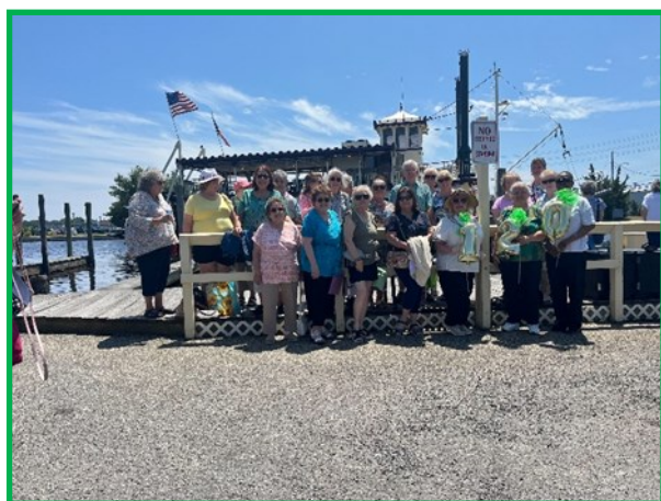
Lunch cruise on the River Lady