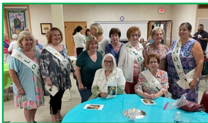
Members of the McAuley Division at the Our Lady of Knock Mass