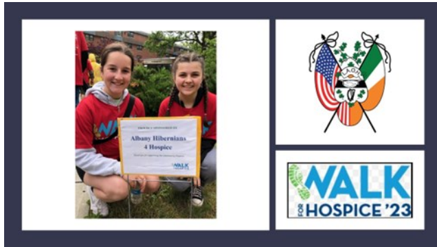
Two of our Junior Division members at “2023 Walk for Hospice” supporting our “Albany Hibernians 4 Hospice” Team