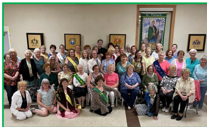
Many divisions were represented at the Our Lady of Knock Mass on August 13 th