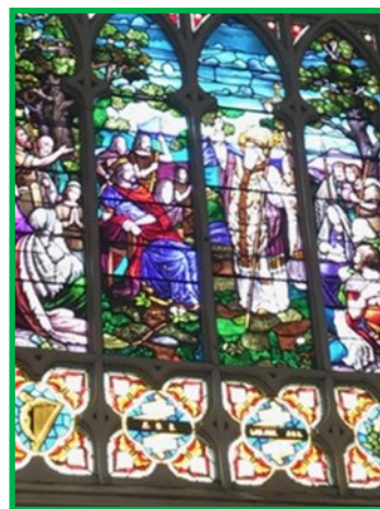
AOH/LAOH stained glass window at the side of the Church.