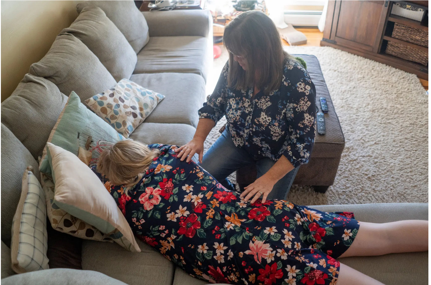
In a soothing massage, Crystol pretended to make a pizza on her daughter's back: kneading dough, spreading sauce and sprinkling cheese.

When Sabrina was 5, genetic testing revealed that she had a rare chromosomal deletion associated with autism and developmental delays.