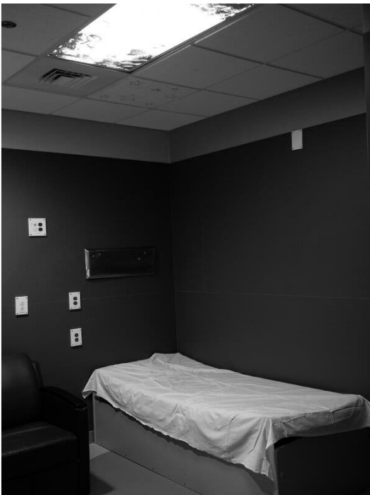
An exam room at Children’s Hospital Colorado, where fixtures and other items had been removed to prevent harm.

Nationally, the number of residential treatment facilities for people under the age of 18 fell to 592 in 2020 from 848 in 2012, a 30 percent decline, according to the most recent federal government survey . The decline is partly a result of well-intentioned policy changes that did not foresee a surge in mental-health cases. Social-distancing rules and labor shortages during the pandemic have eliminated additional treatment centers and beds, experts say.