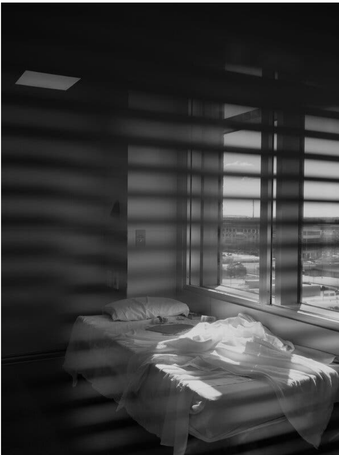
A room at the Gary Pavilion Pediatric Mental Health Institute at Children's Hospital in Aurora, Colo., one of eight inpatient facilities in the area.