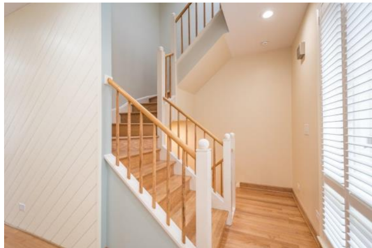
Very sunny main level with windows facing north & south. Plantation shutters thru-out home. New lighting.