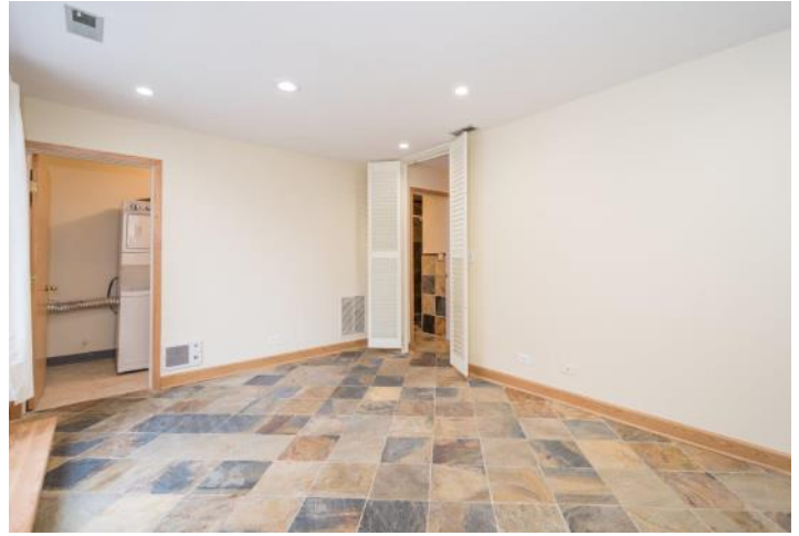
All slate flooring on first level. Step out to large rear patio in private courtyard. Laundry room adjacent.