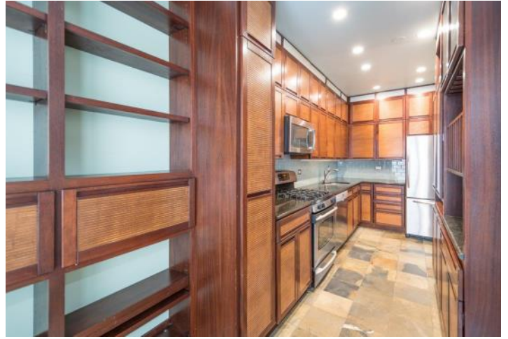
Large Galley kitchen with SS appliances, granite countertops and undermount sink. Tons of cabinets.