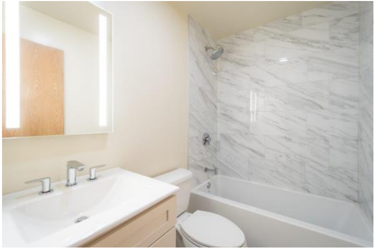
Second bedroom also generously sized and sunny. Second bath on this level has just been newly renovated. All hardwood flooring on this level has also just been refinished.