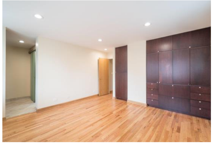
Master bedroom very well lit and spacious. New cabinetry installed and new lighting. Freshly refinished hardwood flooring. Master bathroom adjacent.