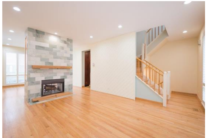
Living/Dining room features freshly finished hardwood flooring and remodeled see-thru fireplace.