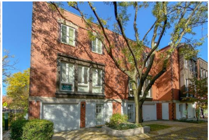
DPII park neighborhood is tree-lined and steps to the lake & loop. 1327 Plymouth is in a private gated community. This area is unique in Chicago. Very close to a myriad of dining & shopping options. Entertainment and Museums Campus within walking distance as are Grant and Millennium Parks.