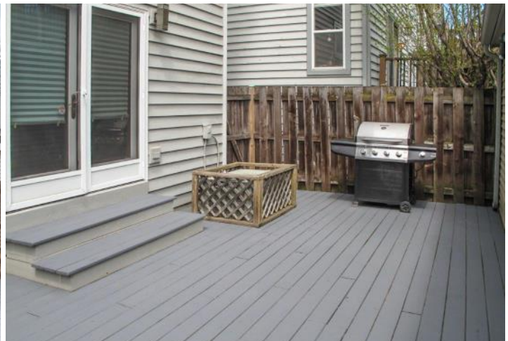
Rock-solid exterior is extremely well maintained and has tastefully done landscaping along with a just rebuilt front porch and secluded rear patio area Two car detached parking garage includes plenty of additional storage space