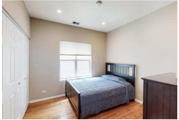
Second and third bedrooms feature oak flooring and are well-lit with plenty of closet space