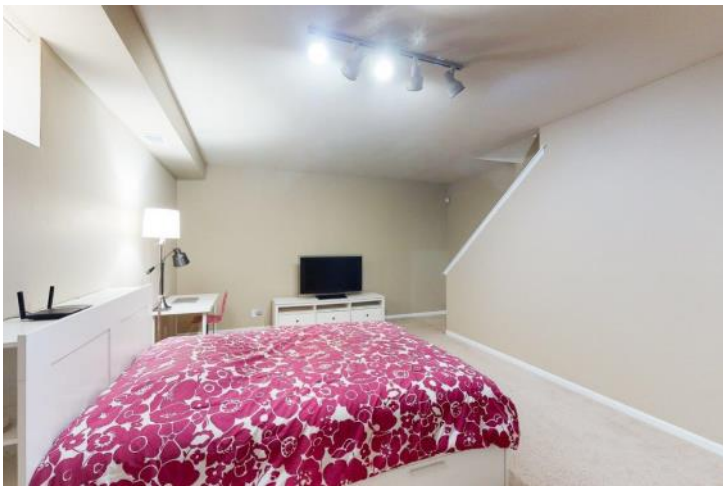
Lower level has an extra large refinished office/4 th bedroom and two additional rooms with mechanicals and additional storage space