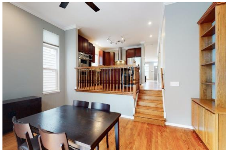
Bright & spacious family room features high ceilings, crown molding, oak shelving & marble surround wood burning fireplace. Huntington fan and custom touches are abundant. Pride of ownership.