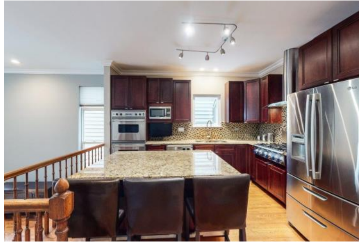
Large renovated Chef's kitchen features Viking & Thermador high end SS appliances, granite counters & generously sized granite breakfast bar.