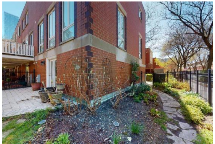
DPII park neighborhood is tree-lined and steps to the lake & loop. 1327 Plymouth is in a private gated community. This area is unique in Chicago. Very close to a myriad of dining & shopping options. Entertainment and Museums Campus within walking distance as are Grant and Millennium Parks.