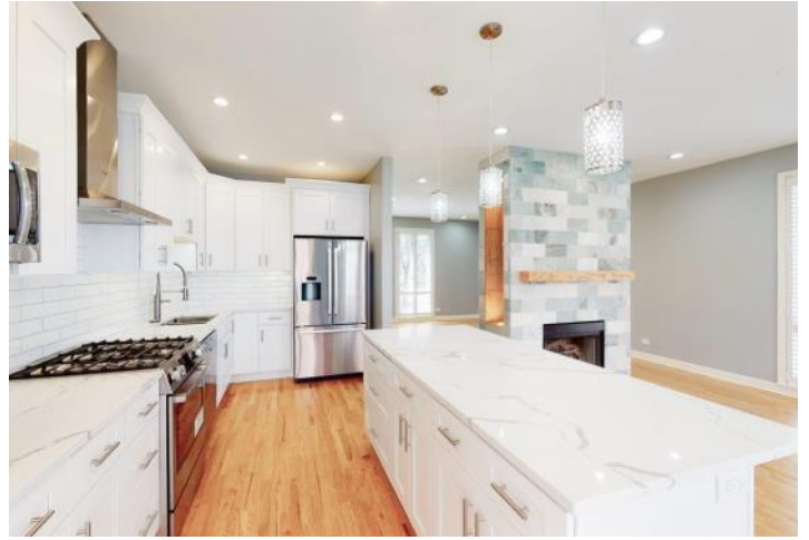
All new Chef's kitchen has been completely opened up and features a contemporary and sleek design