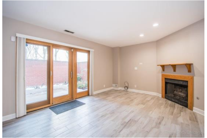
Entry level of this home has been rebuilt: All new heated ceramic tile flooring, new bathroom & doors.