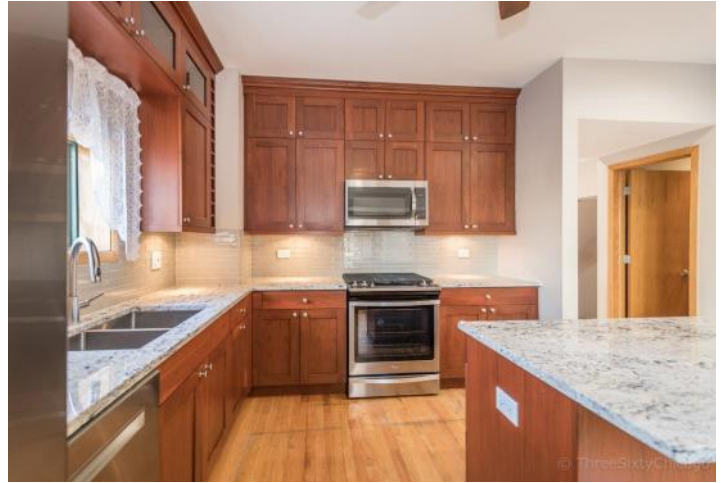
Chef's Kitchen completely remodeled with contemporary finishes and high end appliances