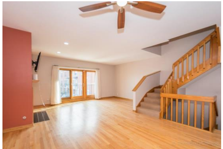
Kitchen opens to private deck, upgraded powder adjacent. Spacious Living/Dining room with fireplace