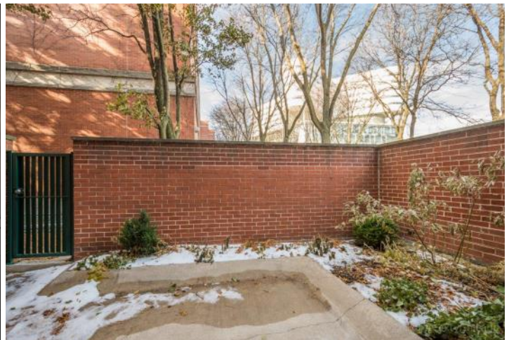
Finest materials used thru-out, including 1st floor powder. Large private enclosed patio,