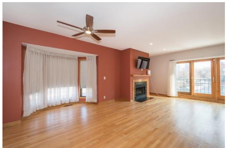
Sunny city views from north & east facing bay windows provide excellent views of the entire city skyline.