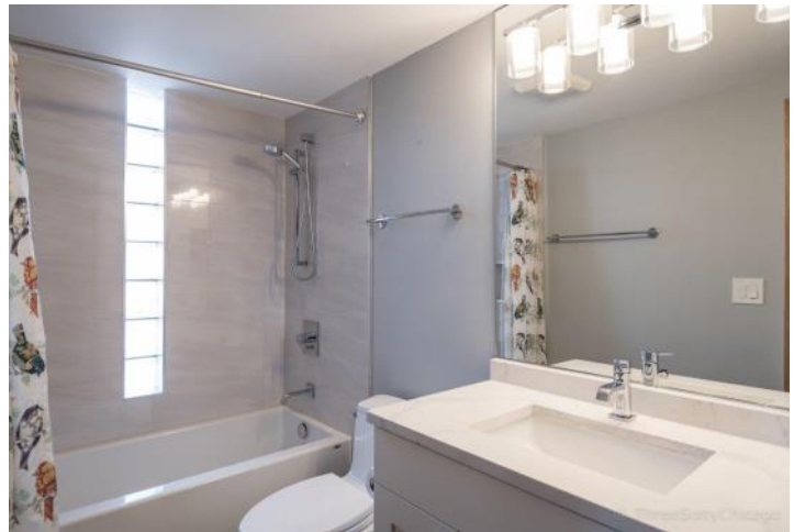
All bathrooms in this home have been completely renovated. Two full sized baths on third level.