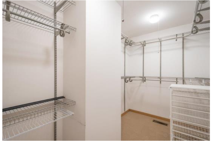
Oversized master suite with vaulted ceilings, skylights & large walk-in closet. Plenty of sunshine.