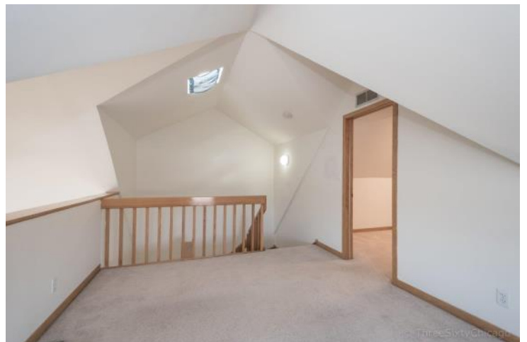
From master suite step up to sunny loft office space and adjacent room for storage or various uses.