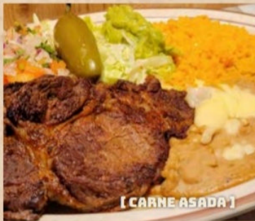
[ CARNE ASADA ]