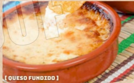
[ QUESO FUNDIDO ]

Steak, cheese and jalapeños, topped with cilantro and sour cream - 10.99