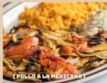
[ POLLO A LA MEXICANA ]

Two grilled chicken breasts topped with grilled jalapeños, grilled onions and salsa verde. Served with rice, a guacamole salad and tortillas - 10.25