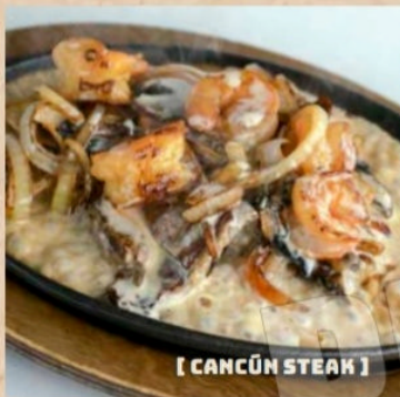
[ CANCÚN STEAK ]