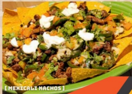
[ MEXICALI NACHOS ]