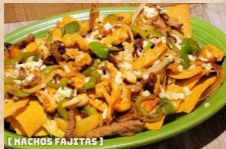
[ NACHOS FAJITAS ]