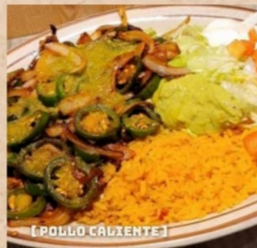
[ POLLO CALIENTE ]

*These menu items are cooked to order. Consuming raw or undercooked meats, poultry, seafood, shellfish, or eggs may increase your risk of food-borne illness, especially if you have certain medical conditions.