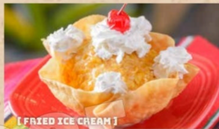
[ FRIED ICE CREAM ]