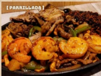
[ PARRILLADA ]