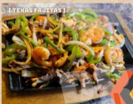
[ TEXAS FAJITAS ]