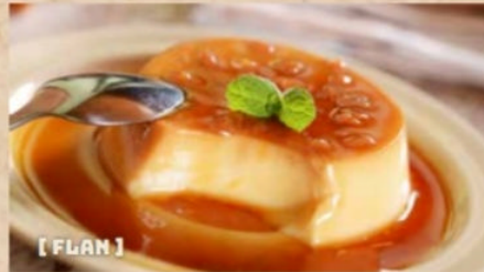
[ FLAN ]

A tortilla wrapped around cheesecake filling and deep-fried. Topped with whipped cream, cinnamon sugar and chocolate - 4.25