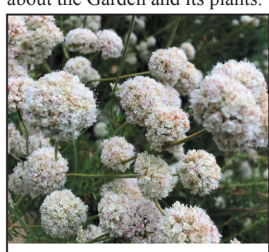
Buckwheat is just one of the native plants in the

We have been hard at work on Plant Identification Signs for the Garden. We now have more than 100 native plants identified in the Garden. However, many have asked us to learn more about the Garden and its plants.