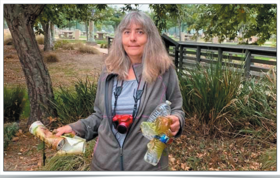
SYV Botanic Garden photos

Then the Garden began almost fifteen years ago, we could not have imagined the many experiences shared in the Garden by individuals, families and groups. Not only have we become familiar with the native plants of our region, but with one another as well. Tiny plants planted by small hands have grown into flowering shrubs and windblown grasses. Trees that once were viewed at eye level now tower over head, providing welcoming shade in the summer heat. The Foundation is so fortunate to partner with the City of Buellton in the development and maintenance of all the Garden spaces. But as the private partner, we also depend on the support of the community. For less than a dollar a week, a single membership can help support the maintenance of the Garden, children's programs and workshops for adults. As we begin a new year at the Garden, following a well needed summer rest, please consider joining the Garden. Just go on line to www.santavnezvallev botanicgarden.org/membership and sign up today. By signing up or renewing now, your membership will be active through 2022. You too can make a difference in sustaining this important community for yourself, your family and the community.