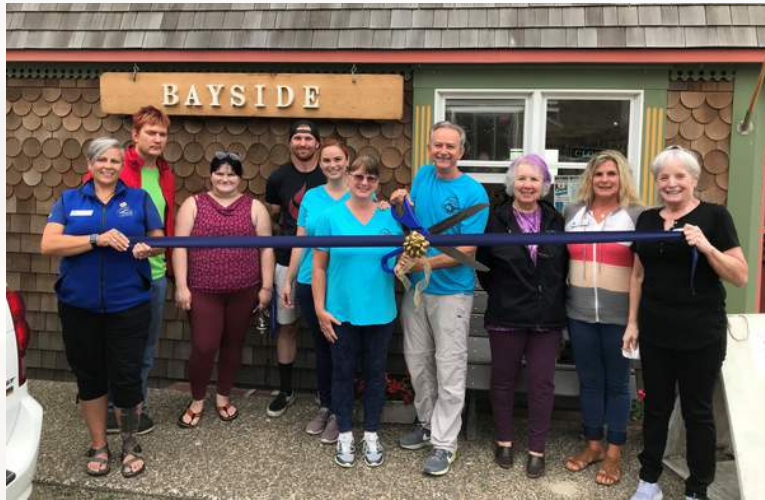
Private ribbon cutting for Bayside Nutrition in Nye Beach