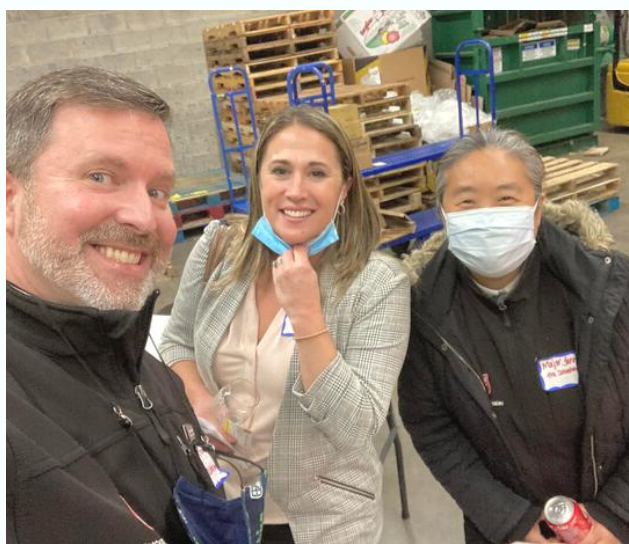
Business After Hours at Grocery Outlet Newport