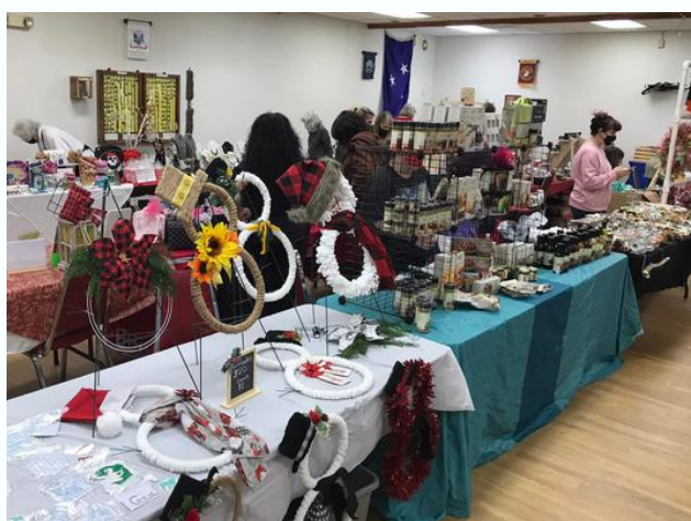
Holiday Bazaar at the American Legion