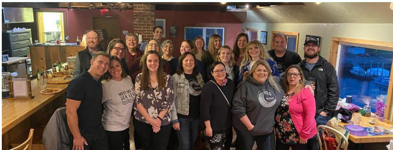
Lincoln City, Depoe Bay & Newport Yo Pros Social Hour at The Horn in Depoe Bay