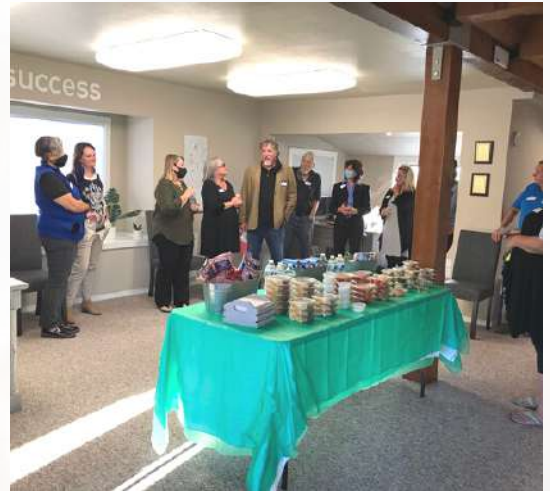
Business After Hours at CrossCountry Mortgage on September 23