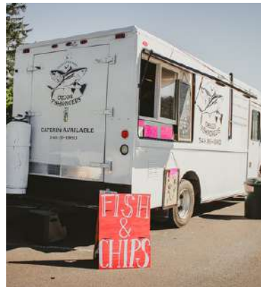
Oregon Fishmongers Food Truck