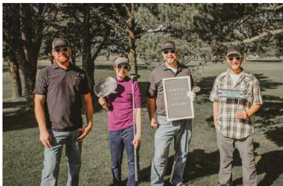
Western Title & Escrow Golf Team