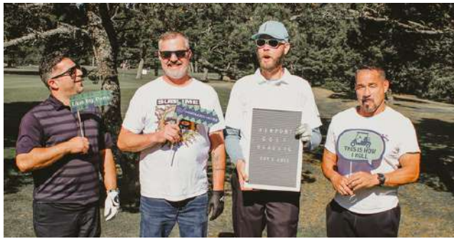
Hallmark Inn & Suites Golf Team