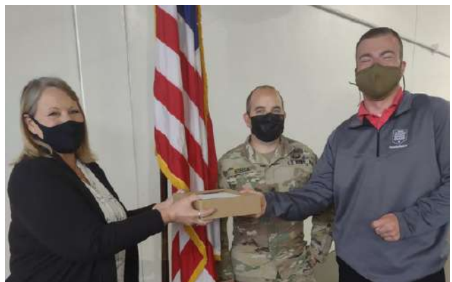
Life Flight and the National Guard Armory, sponsored by the Chamber