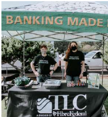
TLC Booth at Hole 1