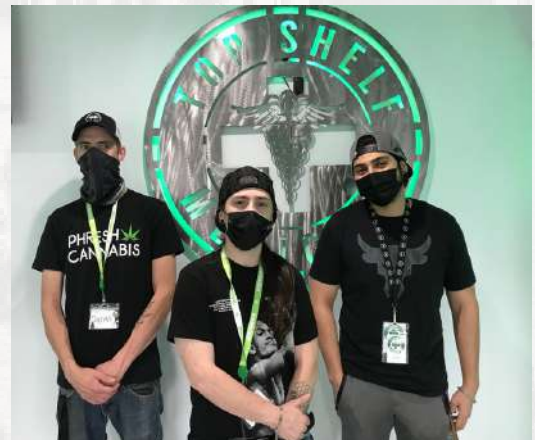
Ribbon Cutting for Top Shelf Medicine on September 10