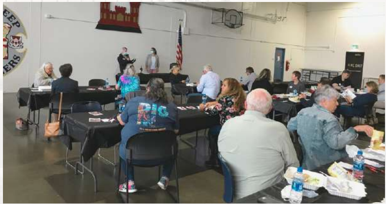
The first in-person luncheon was held at the National Guard Armory on Sept. 10