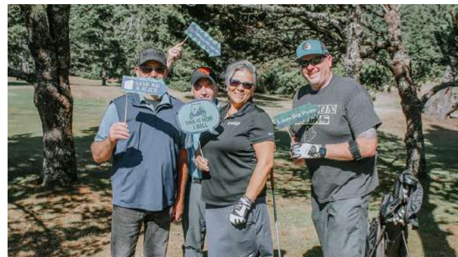
BBSI & Bigfoot Beverages Golf Team