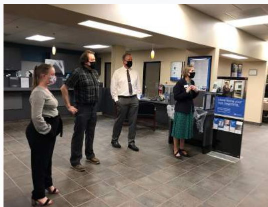
Business After Hours at Columbia Bank