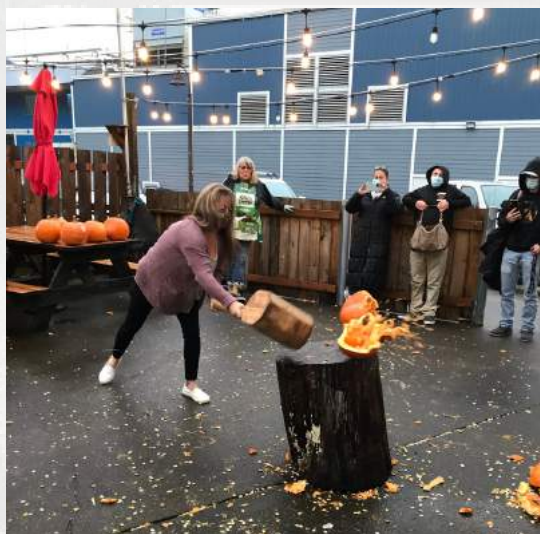
Yo Pros Pumpkin Smash at Rogue Bayfront Pub