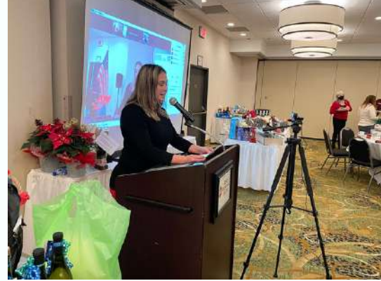
Holiday Luncheon and Raffle at Best Western Plus Agate Beach Inn