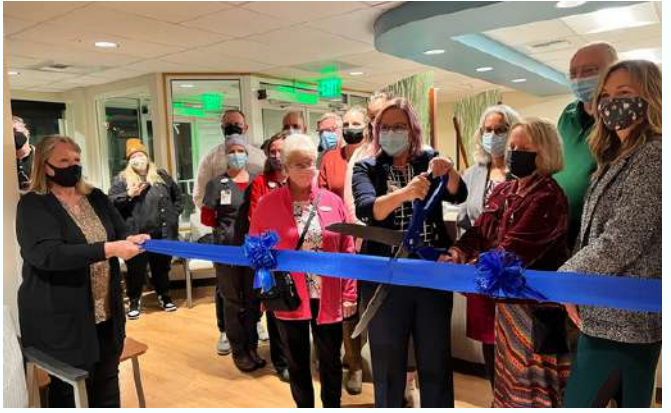
Ribbon Cutting at My Petite Sweet and Samaritan New Walk-in and Occupational Health Clinics