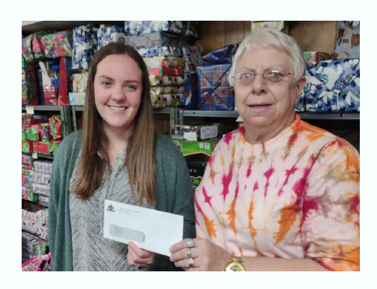
American Legion Yo Pros Donation