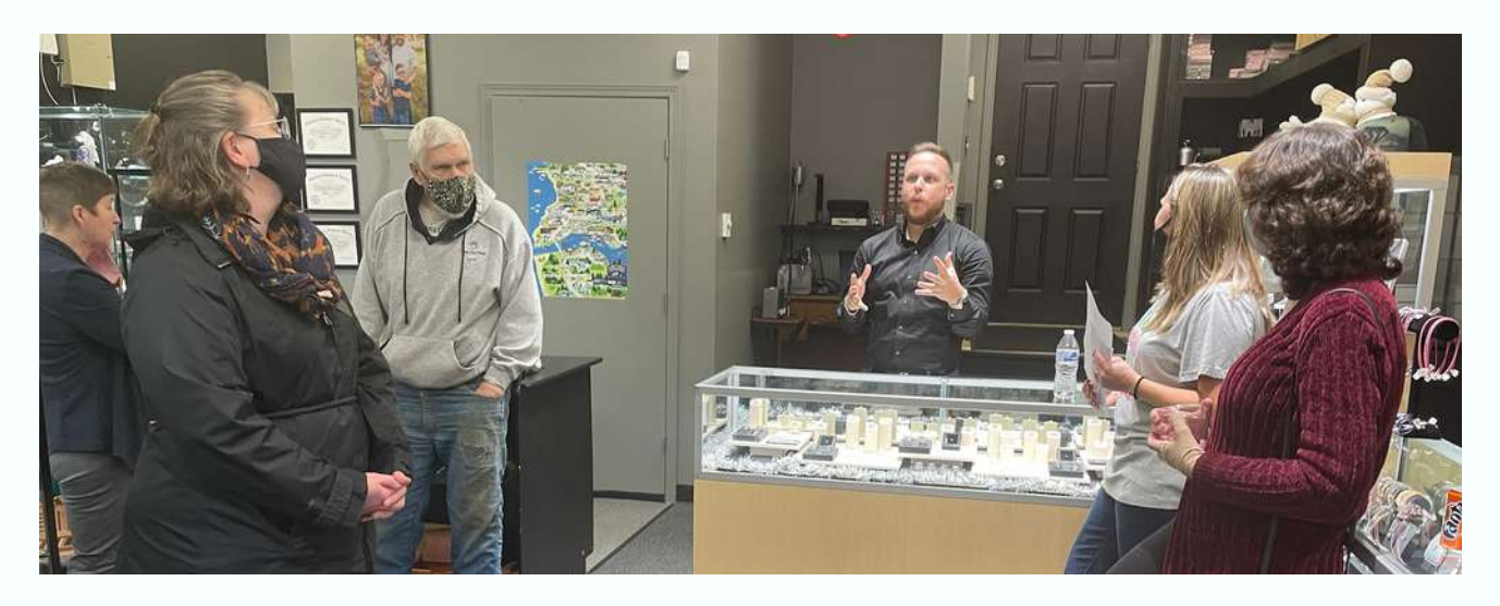
Business After Hours and SJ Custom Jewelers