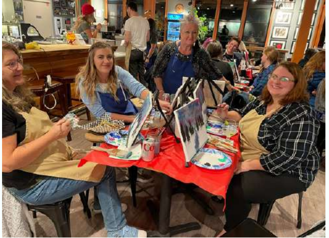
Yo Pros Paint Night