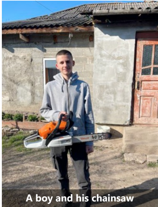
A boy and his chainsaw