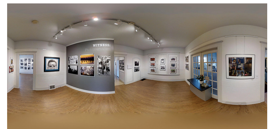
360° View of Witness: Photojournalism