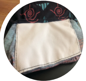
INTEGRATED MASK WITH NOSE CLIP