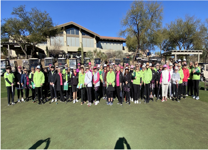
The Verde Sputters enjoy several tournaments each year.

Consider becoming a playing or social member in the SaddleBrooke Verde Sputters! This lively group provides