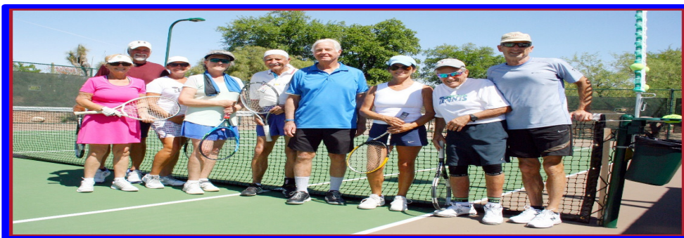
SaddleBrooke Tennis Club

Dedicated to the health and enjoyment of SaddleBrooke Residents