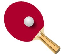
Table tennis is great exercise and helps keep your reflexes sharp.

Come and get reacquainted with a game you may have played years ago!