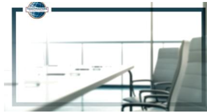
Natural and Adaptive Styles Comparison