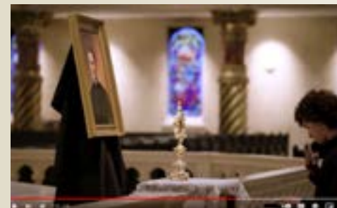
Carry Out Blessed Michael McGivney's Vision

“Father McGivney created a culture of invitation that we must carry forward. So today, I ask every Knight: Will you extend that invitation, that hand of brotherhood, to the next generation?”