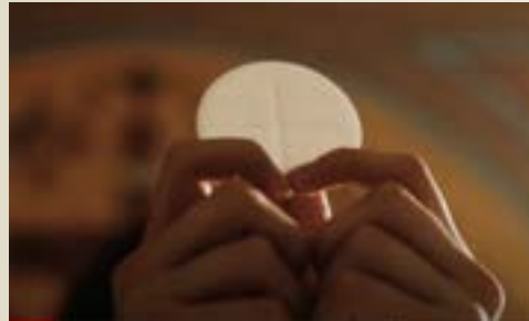
Knights are strengthened in the Eucharist

Show and share these videos with potential members, during council events and programs, and on social media: