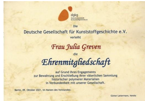
Fig. 1: Certificate of Honorary Membership for Julia Greven

Volksbank Darmstadt eG, Kto. Nr. 0100 63 92 03, BLZ 508 900 00 (IBAN: DE 46 50 89 00 00 01 00 63 92 03; BIC: GENODEF1VBD)