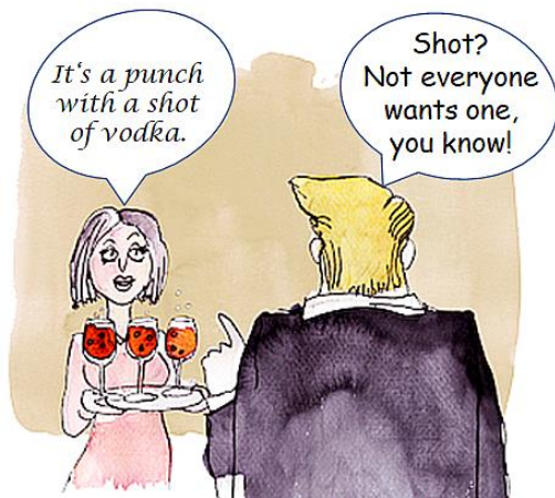
Fig.8: Drinks in times of coronavirus. (Text varies.).

Of course, this also applies to disposable plastic syringes and shots (jabs).