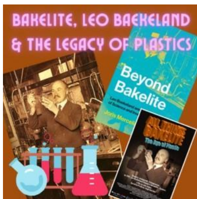
Fig 4: Bakelite, Leo Baekeland & The Legacy of Plastics

https://marktwainhouse.org/event/bakelite-leo-baekeland-the-legacy-of-plastics-a-panel-conversation