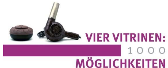
Fig.7: Catalogue front page