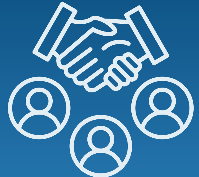
Strategic Partnerships & Workforce

Investor Relations, Marketing, and Operations