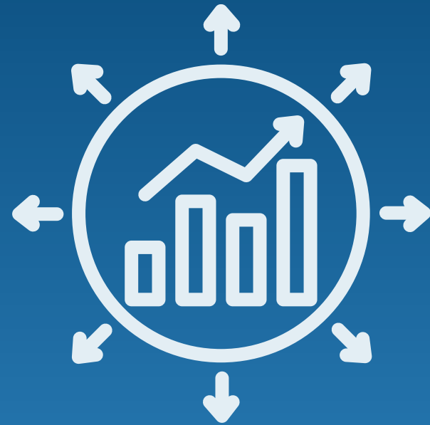
Business Retention & Expansion