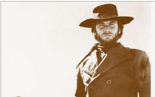
Clint Eastwood in High Plains Drifter

Closing Night Film: Clint Eastwood's first Western as both director and star is a revenge tale of a mysterious stranger who rides into a settlement, where the citizens beg him to defend them against a group of outlaws.