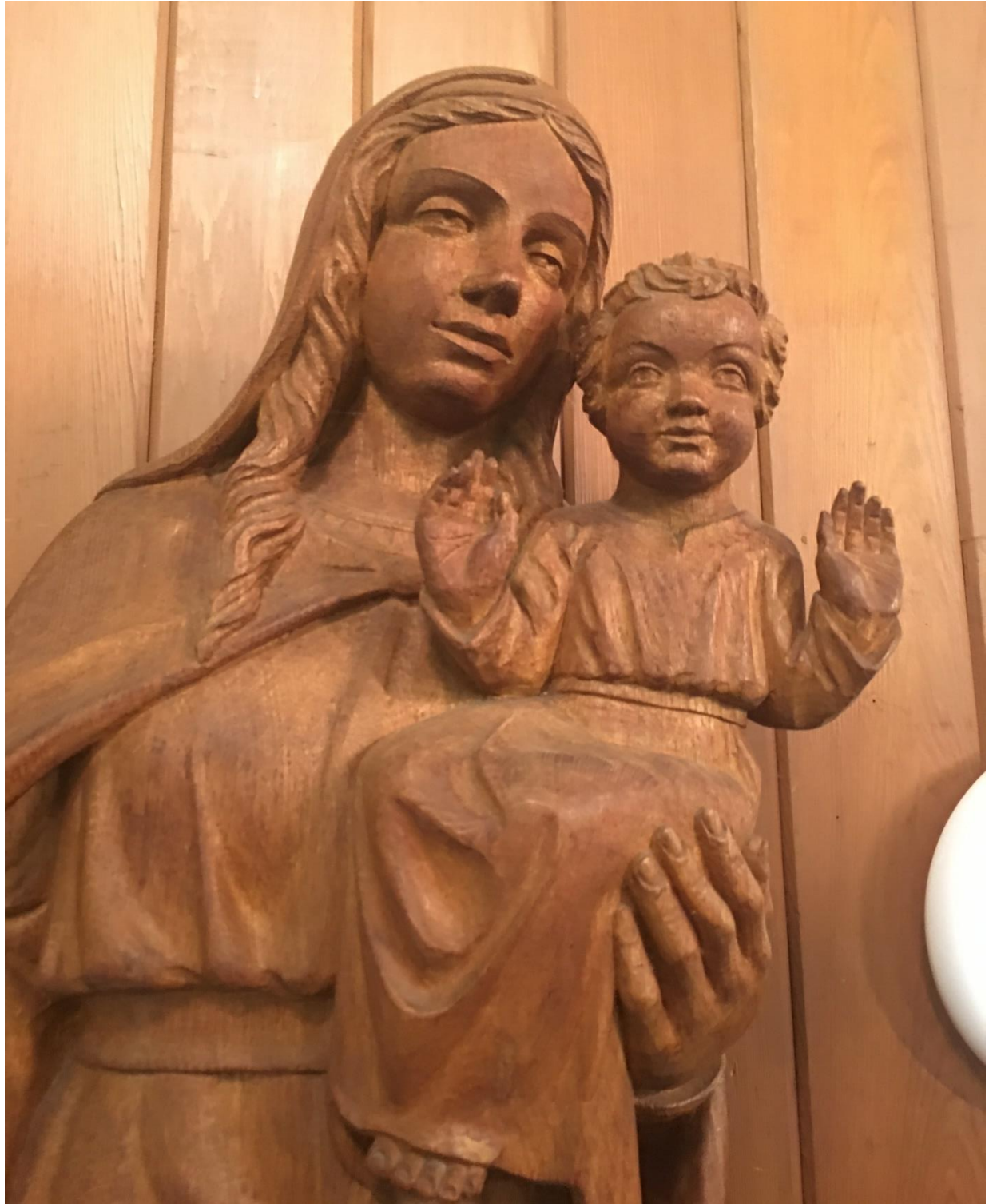
Carving in St. Mary's Hall