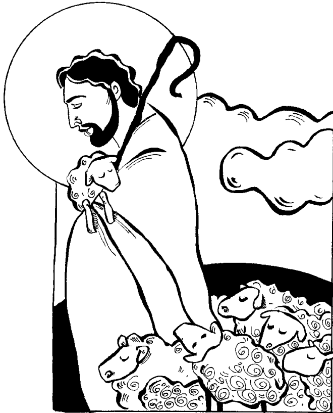
THE LOST ARE FOUND, THE WEAK ARE CALLED.

"I tell you, there will be more rejoicing in heaven over one sinner who repents than over ninety-nine righteous persons who do not need to repent" (Luke 15:7).