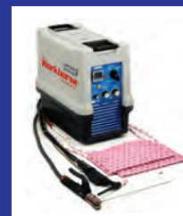
Workhorse 300SH Combined Preheater & Welder