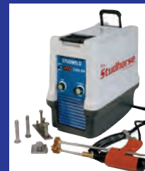
Studhorse 1000DM & 1200DM Stud Welders