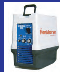
Workhorse 300S Stick/Lift Start TIG