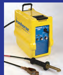
Ironhorse 300S 700V DC Input