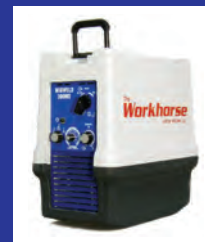
Workhorse 300MS MIG weld