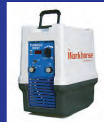
Workhorse 300ST ArcStarter TIG