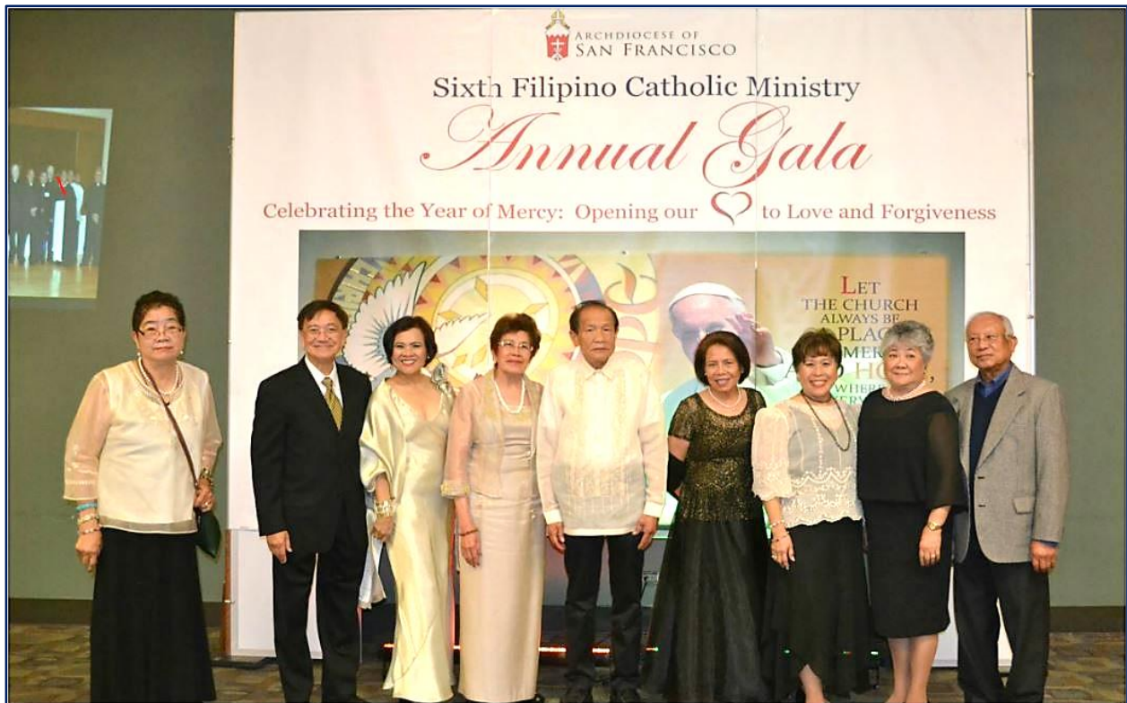
Picture: Attendees at the 6 th Annual Filipino Catholic Ministry Gala

This past October we held our 6 th “Annual Filipino Ministry Gala” at the Cathedral of St. Mary. The annual gala, held during National Filipino American Heritage Month, provides an opportunity for Christian fellowship and also enables the Filipino community to showcase its Philippine cultural heritage. This event was well attended by approximately 500 people. One of the highlights of this event was a performance by the Filipino Singing Priests of the Archdiocese of San Francisco .