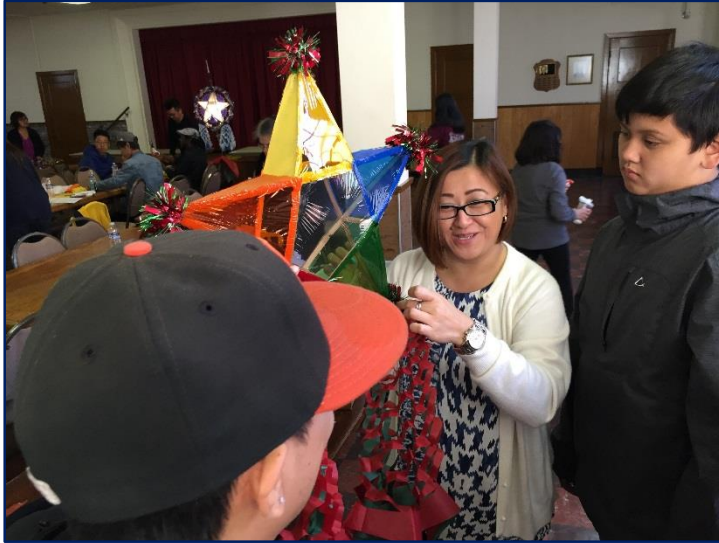
Picture: Annual Parol Making Workshop at St. Monica's Church

In November, we held our annual “Parol Making Workshop” at St. Monica’s Church. The parol is a star shaped ornament that is the symbol of a Filipino Christmas. It emulates the Star of Bethlehem. Long ago, parols were used as lanterns to light the way of the faithful making their way to the predawn or late night masses during the Christmas season (Simbang Gabi mass).