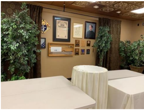
Freshly painted bar and rearranged pictures on the Knights wall.