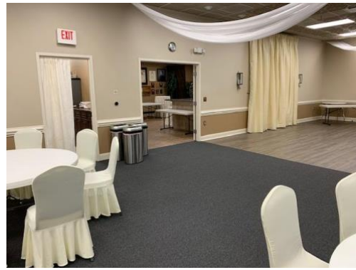
New double wide door into the bar, new dance floor and new carpet in the Banquet Room.