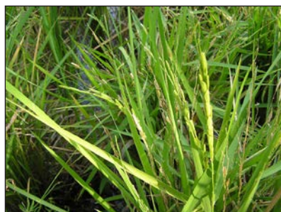
[JARDIN D'EDEN BOTANICAL PARK, REUNION ISLAND]

This course will address the conflict between the needs both to increase food production and to protect the environment. We will assess options for developing agricultural systems that can provide sufficient nutritious food for everyone, promote economic growth to reduce poverty, protect ecosystems, and reduce greenhouse gas emissions.