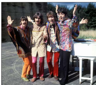
[PAROPLANE MUSIC SWEDEN]