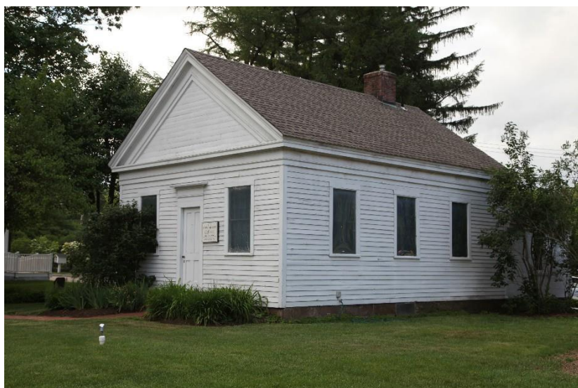
Schoolhouse No. 3 – built in 1823, moved to current site 1982 8 East Main Street, Avon