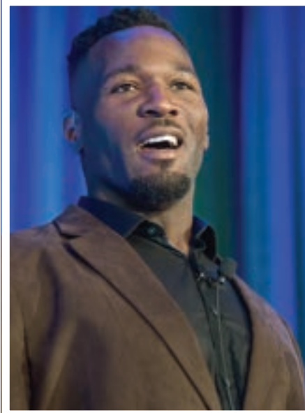
Guest Speaker Derrick Coleman Super Bowl Champion and NFL's first deaf offensive player